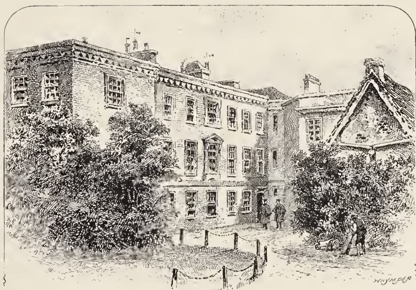
FISHER'S BUILDING AND END OF 'RATS' CASTLE,' BALLIOL COLLEGE

Copied from a print in an old Oxford Guide